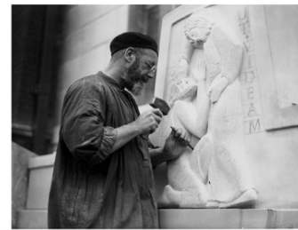
Christie's vs Eric Gill, p18