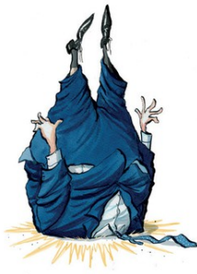
No plan B, p60