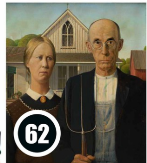
▲ The story of Grant Wood's Depression-era masterpiece

AMERICAN GOTHIC, 1930, FRIENDS OF AMERICAN ART COLLECTION © GRANT WOOD X1