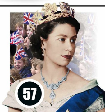
▲ An alphabetical overview of Elizabeth II's life and reign