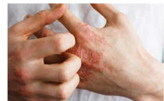
Managing eczema in older adults p17