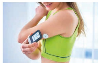
Updated NICE guidelines on type 2 diabetes p12