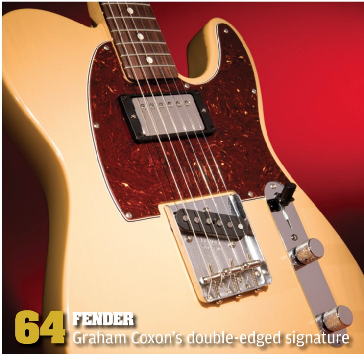
64 FENDER Graham Coxon's double-edged signature