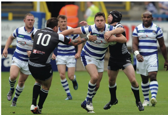
Cup winners v champions: Halifax and Sheffield Eagles will kick things off on the last day of January rlphotos.com