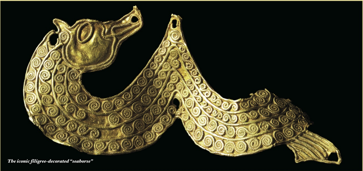
The iconic filigree-decorated "seahorse"