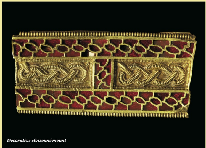
Decorative cloisonné mount

POTTERIES MUSEUM & ART GALLERY (3), BIRMINGHAM MUSEUMS TRUST (1)