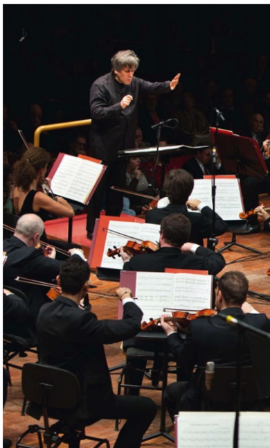
Antonio Pappano at the Auditorium Parco della Musica

Quattro Pezzi sacri, Libera me – selected comparison: Noseda (5/11) (CHAN) CHAN10659