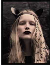
ILLUSTRATION TED TUESDAY

KATRIN WEARS DRESS BY MARIOS SCHWAB; HEADPIECE BY FLEET ILYA