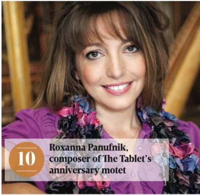
10 Roxanna Panufnik, composer of The Tablet's anniversary motet