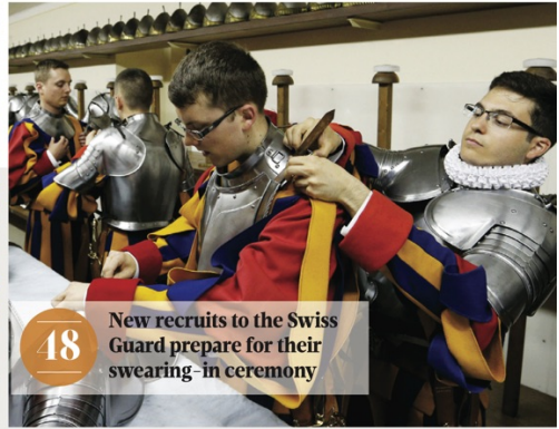
48 New recruits to the Swiss Guard prepare for their swearing-in ceremony