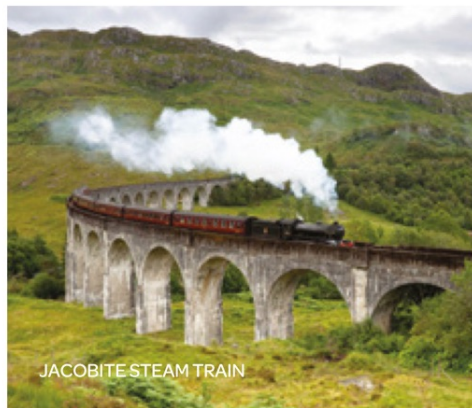
JACOBITE STEAM TRAIN

Jacobite steam train ( westcoastrailways.co.uk/jacobite ) is one of the greatest railways journeys in the world. Starting near Ben Nevis, it snakes through the deep lochs, rivers, and gorgeous, sometimes snow-topped, mountains. For many children, the most exciting section of the line is across the 21-arched Glenfinnan viaduct, made famous by the Harry Potter films. If you're lucky, the train will pull to a halt here to let you drink in the view. The route is 84 miles and a real holiday highlight.