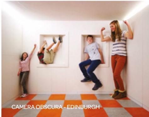
CAMERA OBSCURA - EDINBURGH

head to the capital of the country for an indoor day of play and education. A six-storey, magical adventure, Edinburgh's Camera Obscura and World Of Illusions ( camera-obscura.co.uk ) is a fun-packed, very silly way to