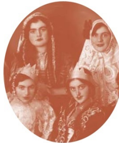
JEWS OF BULGARIA PAGE 13