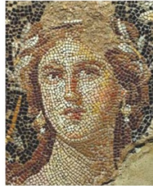
JEWS and SHOPPING PAGE 10