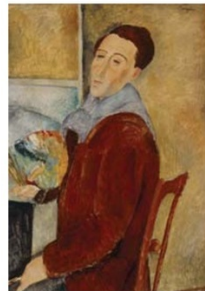
MODIGLIANI PAGE 36