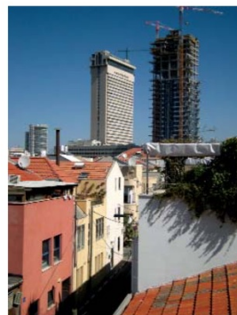
NEVE TZEDEK PAGE 16

CENTRE SECTION: PAGES 27-33 THREE MONTH GUIDE TO EVENTS IN THE UK AND BEYOND