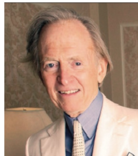
Archbishop Chaput on a poignant and intimate new papal documentary p29 Tom Wolfe: the man who made literature fun p28

The Royal Wedding revealed British church architecture in all its glory p15