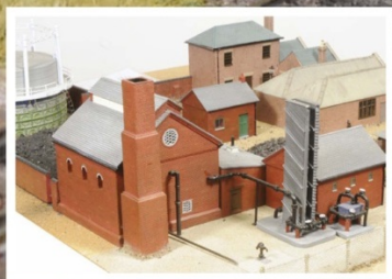
BUILD A GASWORKS!