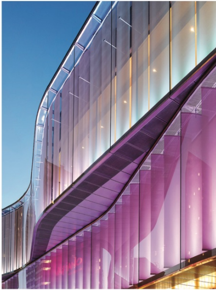
Pei Cobb Freed & Partners has expanded the luxury Nimble Hotel in Copenhagen's Tivoli amusement park, mixing Moorish fantasy with water-like fluidity