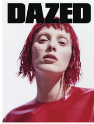
Karen Elson Latex t-shirt Givenchy Haute Couture