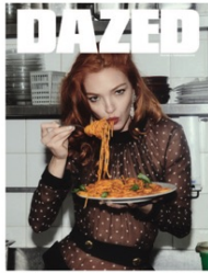
Mariacarla Boscono Styling Elizabeth Fraser-Bell Polka-dot chiffon dress with buttons Prada, art deco platinum and diamond earrings 1930 BVLGARI Heritage Collection