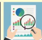
CHART THAT TELLS A TALE Investment insights from a look behind the economic data

EDITOR'S SHOWCASE Our new podcast highlighting the magazine picks of the month