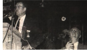
Bygone era. PAGE 88