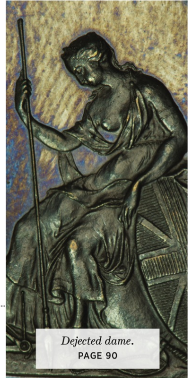
Dejected dame. PAGE 90