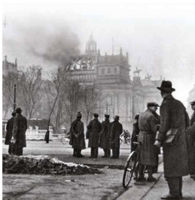
Discover why Hitler's Germany has spawned a plethora of conspiracy theories, on page 59