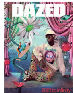
Artwork MITRILO All clothes and accessories GCDS SS21 Out of This World collection