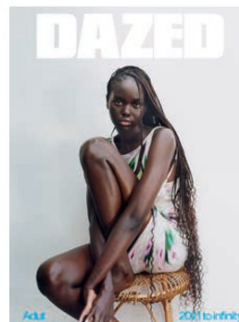
ADUT AKECH Photography SENTA SIMOND Styling AGATA BELCEN Printed cotton voile tank dress Kenzo SS21