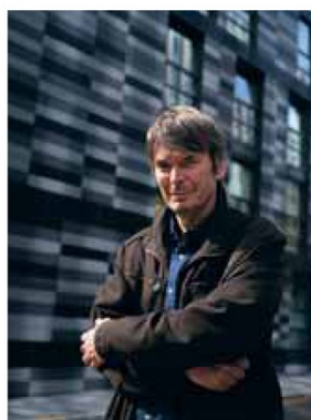
King of tartan noir: Ian Rankin

Please note that all submissions to the letters page, our competitions and reader offers are accepted solely subject to our terms and conditions: details available on our website. Subscription rates: UK £119.99; Europe €159.99; Rest of World US$199.99. Syndication/permissions/archive email: permissions@newstatesman.co.uk . Printed by Walstead Peterborough Ltd, tel +44 (0)1733 555 567. Distribution by Marketforce. The New Statesman (ISSN 1364-7431) is published weekly by New Statesman Ltd, 12-13 Essex Street, London WC2R 3AA, UK. Registered as a newspaper in the UK and USA