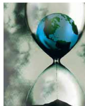
Time's up: the Greens' failure